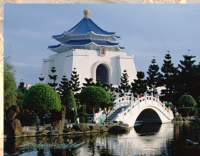
Chiang Kai Shek Memorial Hall