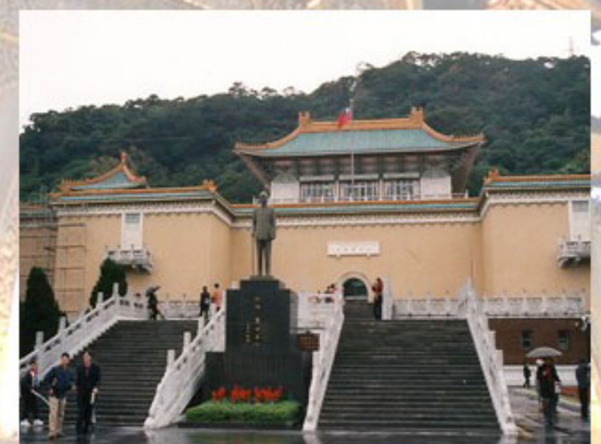
National Palace Museum