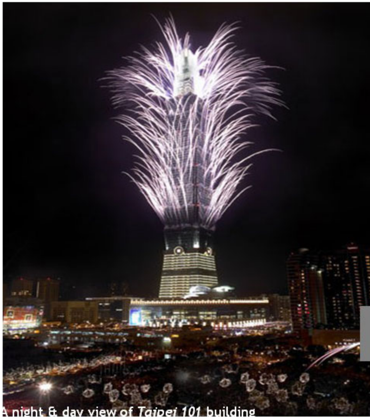
A night & day view of Taipei 101 building