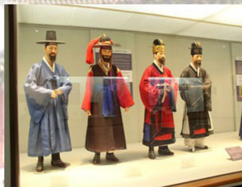
Inside the Folklore Museum