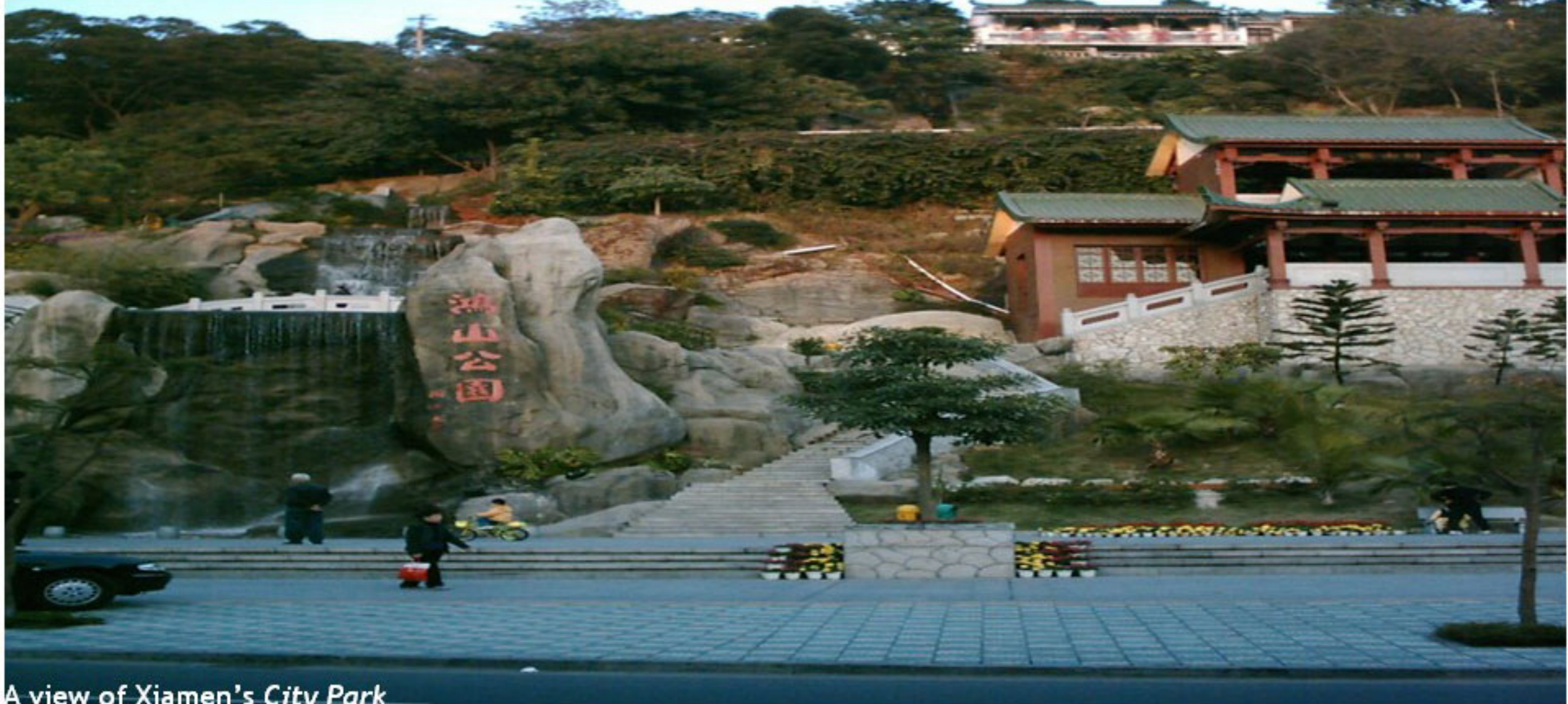
A view of Xiamen's City Park

Hotel : Xiamen Plaza (3 star) 2-4 pax : RM 1,760 per adult / RM 1,360 per child 5-6 pax : RM 1,660 per adult 7-9 pax : RM 1,620 per adult